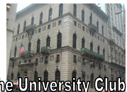
The University Club