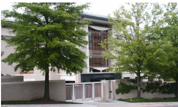
The Singapore Embassy

All on-campus seminars and workshops are held in The Burton D. Morgan Center Room 218. All student presentations are held in Room 114.