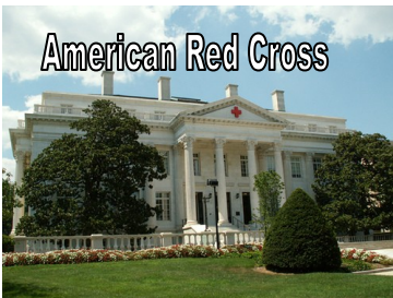
American Red Cross

All on-campus seminars and workshops are held in The Burton D. Morgan Center Room 218. All student presentations are held in Room 114.