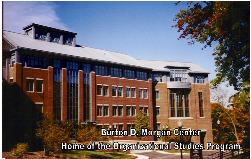
Burton D. Morgan Center Home of the Organizational Studies Program