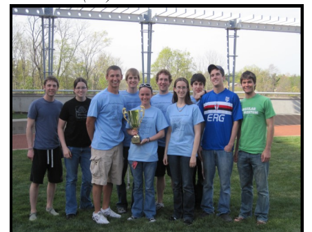
Physics majors regain their title as Science Olympic Champions, Spring 2010!