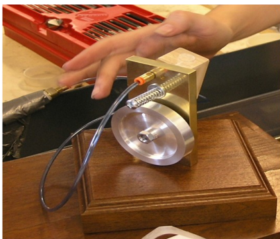
Maureen Crotty's ('10) vertical piston, compressed air engine.