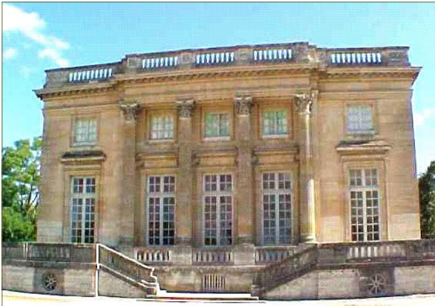
The photo above depicts the west elevation of La Petit Trianon in the Garden of Versailles built in the sixteenth century for Louis XV and Madame de Pompadour.