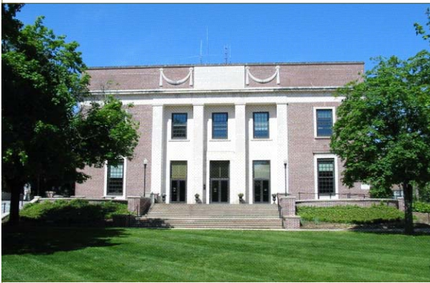
The eastern façade of the William H. Doane Library in 2003.