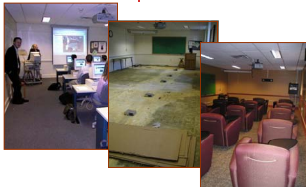
Below: E204, previously the Electronic Classroom, before, & during renovation. Picture 3 - waiting for the plasma screen TV installation.