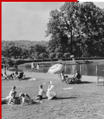
“Denison at Leisure” display illustrates extracurricular activities of students.

This summer, we welcomed Rachel Gelenius as the Wallace Chessman Intern in the archives. She worked for 10 weeks on a variety of projects, including processing the Harry Truman papers and creating a finding aid for that collection. Rachel cleaned printing plates and trophies, and placed glass plate negatives in acid-free envelopes. She tran-