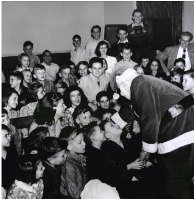
Students bring Christmas cheer to the children's home in Newark.