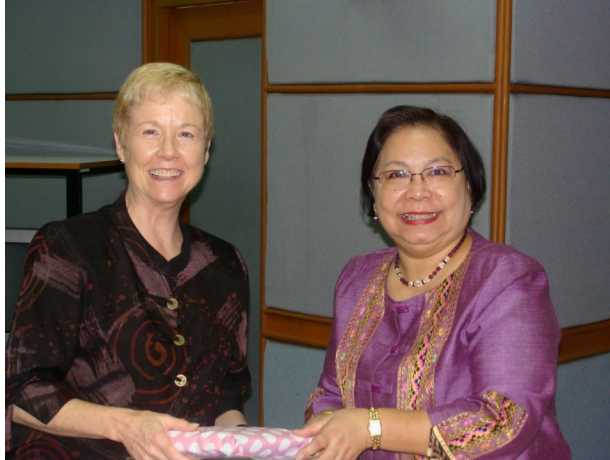
Chulalongkorn workshop traditional exchange of gifts