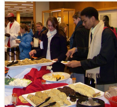
Guests participate in the library's MLK, Jr. Reception on Monday, January 18.