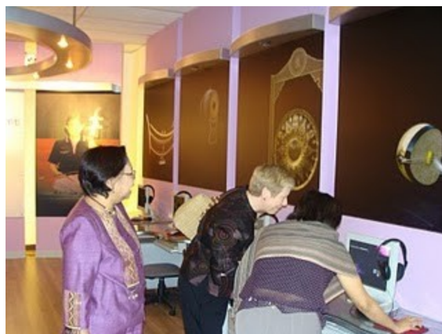
Chulalongkorn library media center

The January 7-8, 2010 workshop at Thammasat attracted about 75 librarians from public and private universities all over Thailand. My keynote addresses, titled "Library Collaboration: Why and How?" and "Library Collaboration: the Ohio-LINK Experience," were followed by presentations by Thai colleagues. Their presentations included topics such as next steps in Thai library collaboration, open source resources for collaboration, PULINET (Provincial University Library Network) activities, the private universities' point of view on