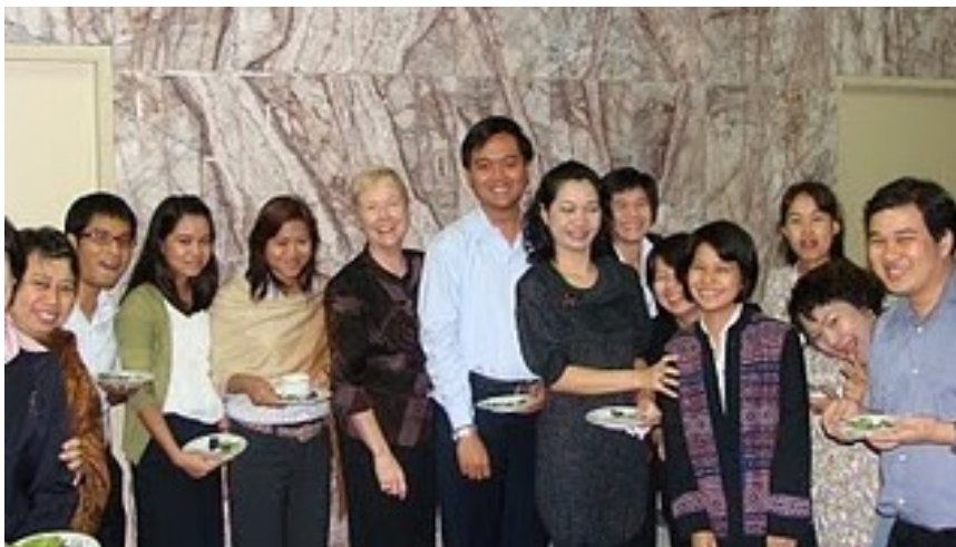
Chulalongkorn University workshop-a lively coffee break

I also enjoyed trips hosted by my Thammasat colleagues, first to Bangkok's Ancient City http://www.ancientcity.com/?q=en/index and later a weekend in Nakhon Ratchasima (Korat) Province. If you'd like to see photos and read a bit more about my trip, you can find those at my blog: http://thailand-2009-cochrane-middleman.blogspot.com/